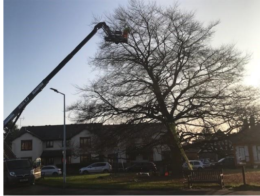
New lights are put onto the tree

Before the new lights were put onto the tree, it was pruned.