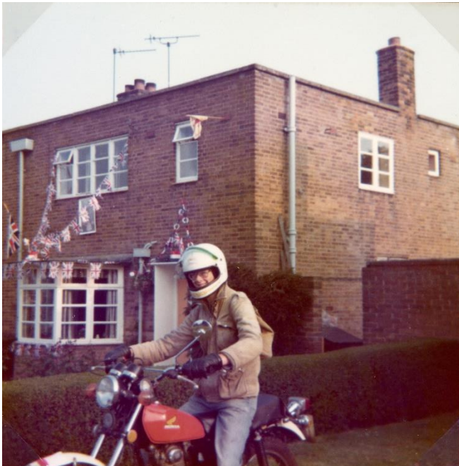
This was before the flat roofs were replaced on the houses on the Elm Road estate.