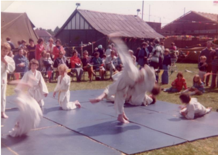
Judo (note the old football pavilion)