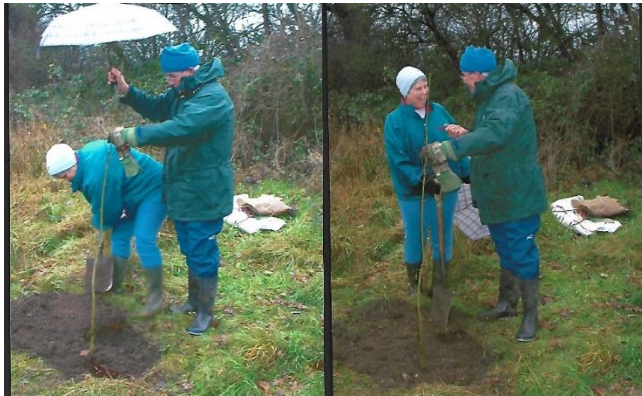
In 2006, an ash tree was planted in memory of Roger Ainsley.