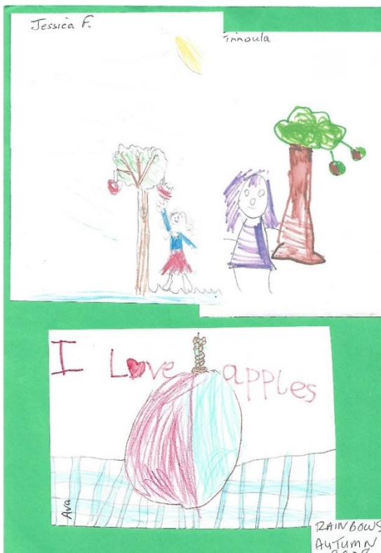
In 2008 Rainbows came to the meadow and were inspired to draw pictures.