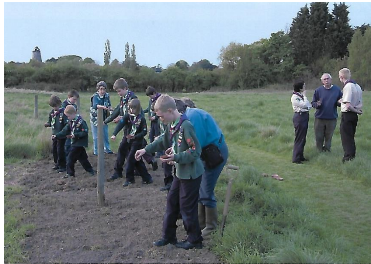
In April 2007, local cub scouts helped to plant seeds.