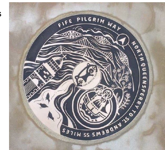
Example of a waymarker which is embedded in a pavement or wall

Waymarkers will provide the infrastructure for further development of the arts trail over time. We will consult and involve the community at every stage of development.